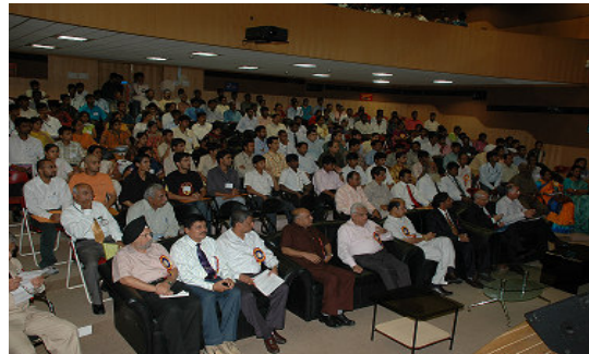
10th ISTE Convention Participants