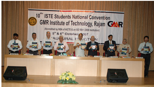
10 th ISTE Inaugural function