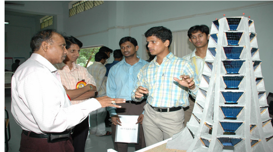
10th ISTE Convention Project Exhibition