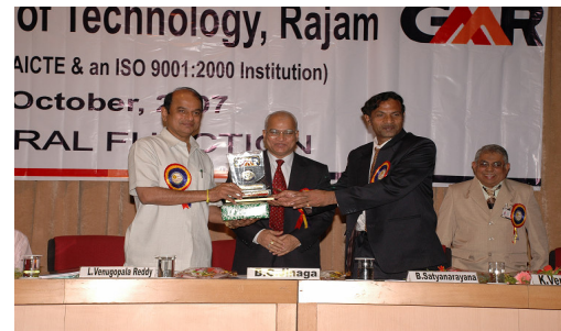
10th ISTE Convention Inaugural by VC, AU, Vizag