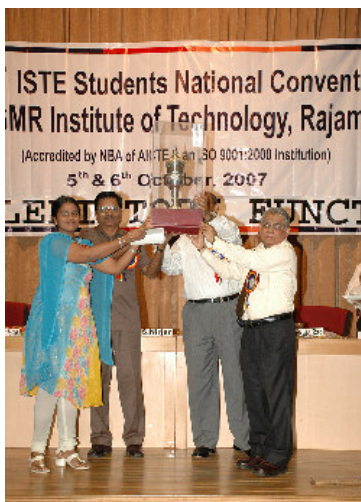
GMRIT got best overall performance award by an engineering college at 10th ISTE Convention